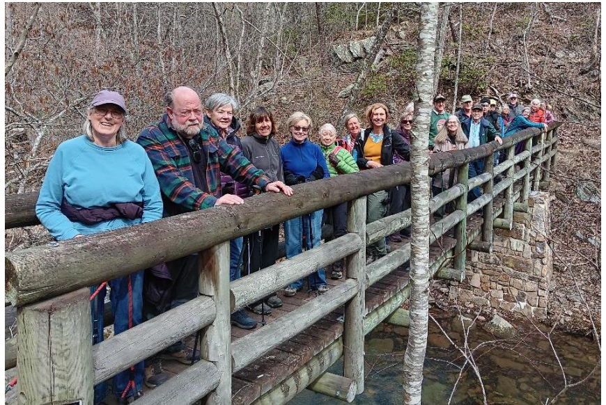
Hike to John's Hollow Shelter on the AT March 7, 2025