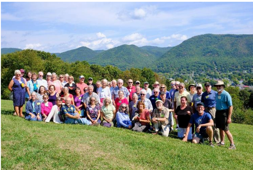
Annual Picnic, 2024