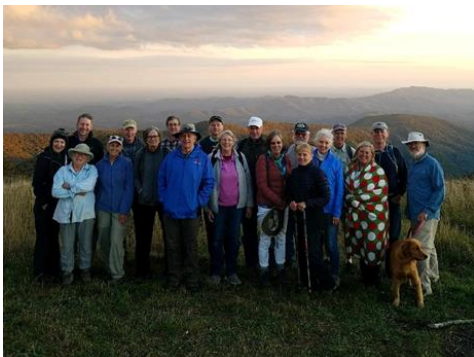
A group of Newcomers enjoyed the Sunset Picnic Hike on Cole Mountain, October 22